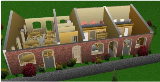
preliminary project for the guests house