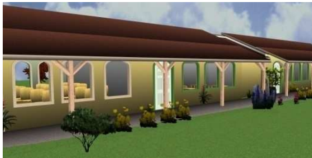
preliminary project for the school, view from the street/from the schoolyard

Following the request from the town of Ambohidratrimo as well as parents and teachers representatives, we are currently working on a project to build a State primary school with a capacity of 400. A direction committee has been set up to involve locals in the elaboration of this project.