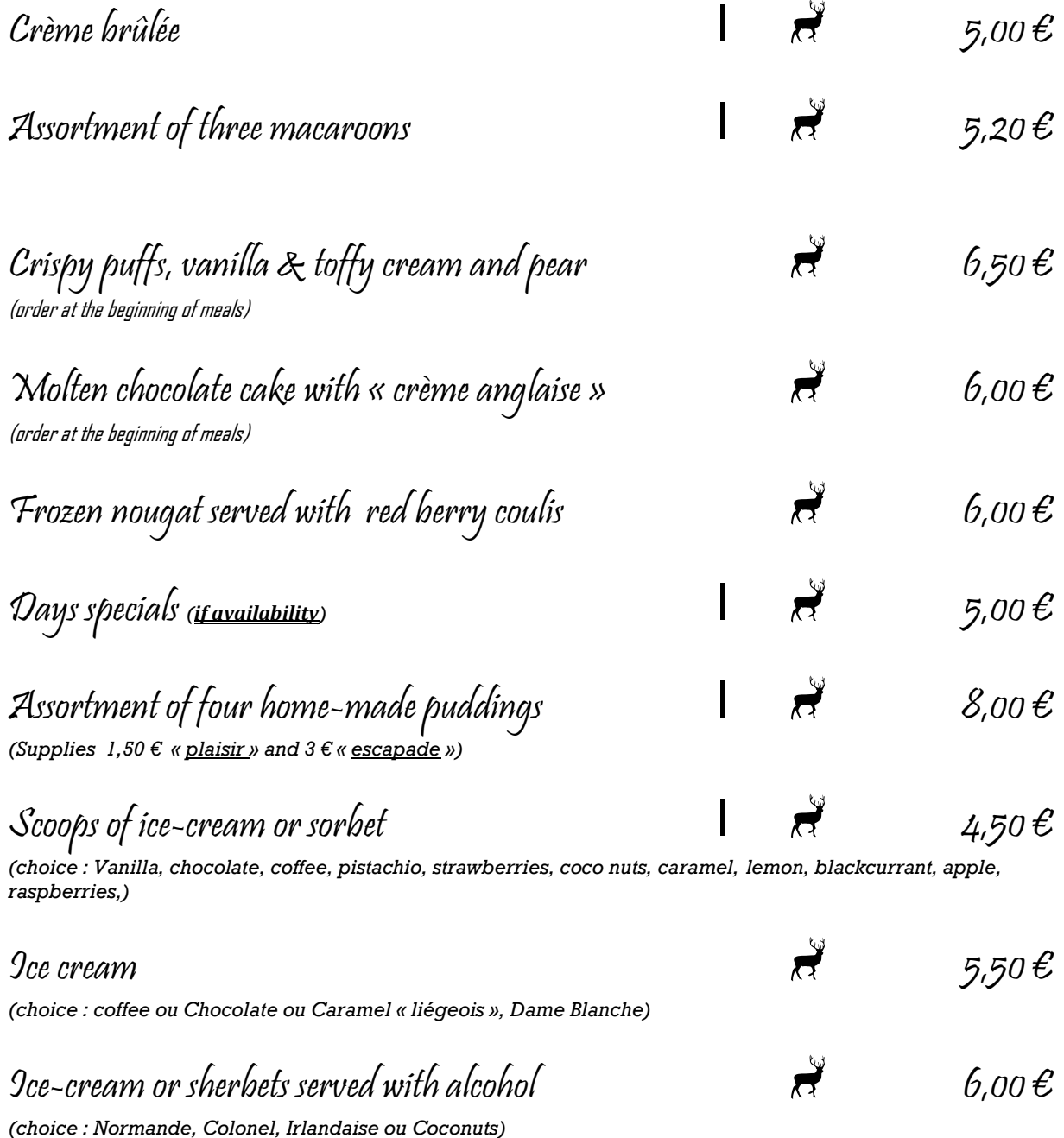
Crispy puffs, toffee and vanilla cream and pear