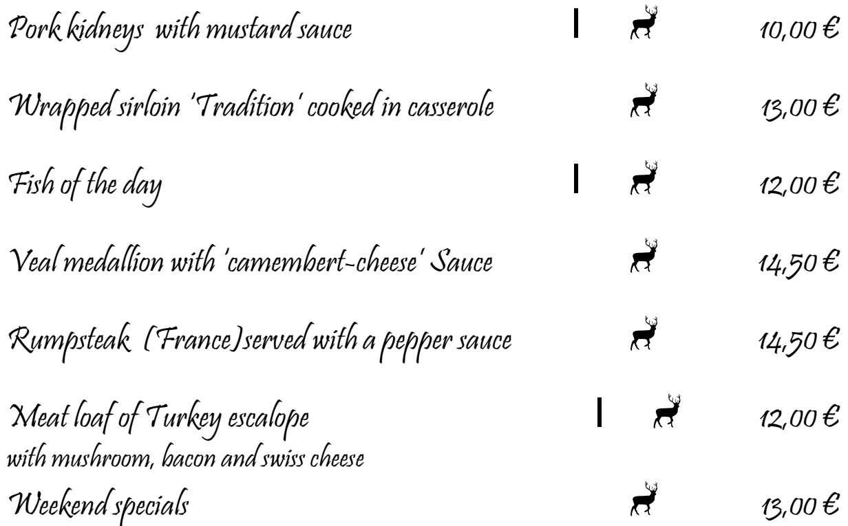
Turkey with mushroom, bacon and swiss cheese